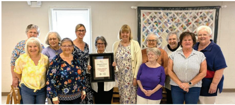
The Nolensville First UWF won the Harpeth River District Annual Meeting Attendance Award.