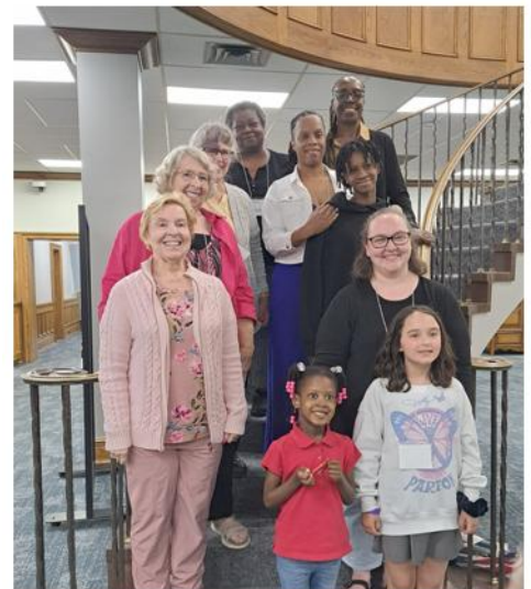
Members of Red River District UWF who attended the Conference Mission U at Scarritt Bennett in Nashville on June 12-14

All are welcome and encouraged to attend! Don’t miss this important opportunity to learn, reflect, be inspired, and share in fellowship. Come be encouraged---and bring a friend!