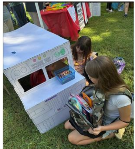
The color-the-cardboard school bus was a highlight for children and adults.