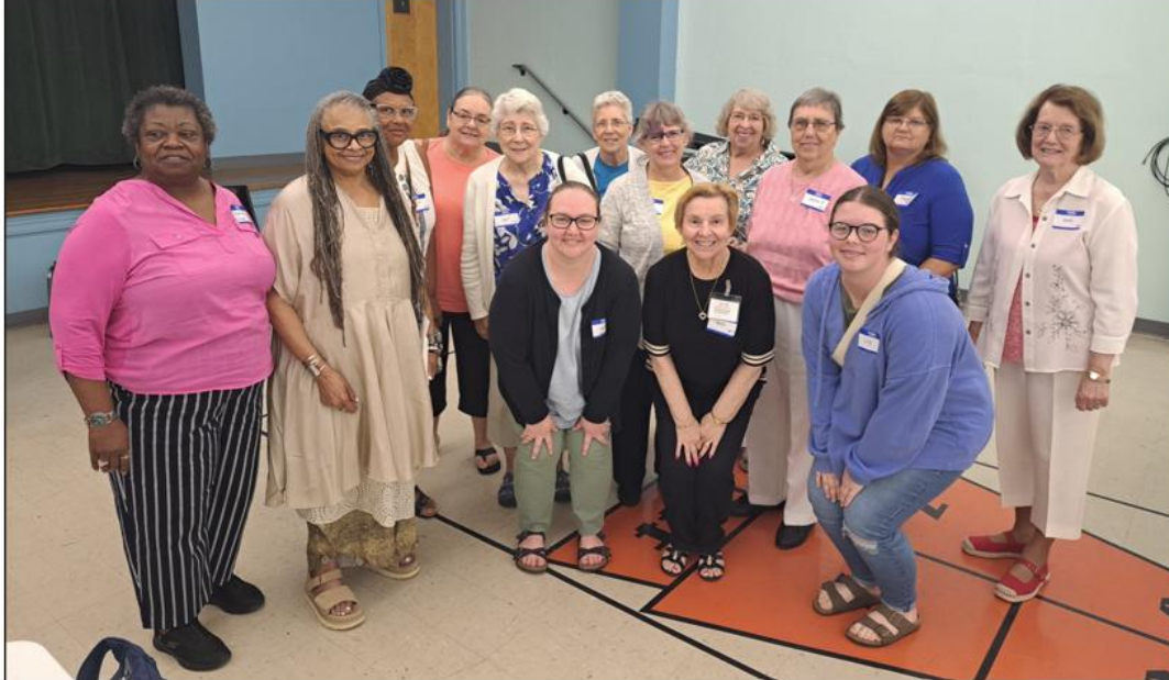
UWF members from 8 churches in the Red River District attended the Racial Justice event.

Ladies from United Women in Faith from eight churches in the Red River District met in Nashville on Saturday, July 12, to attend a Conference Racial Justice event at McKendree UMC.