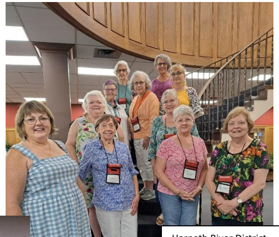
Harpeth River District