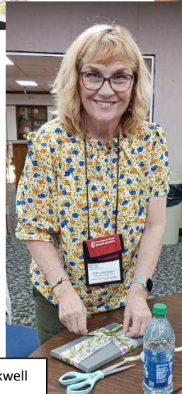
Beth Stockwell Crafts