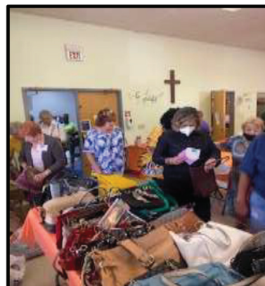
CRD UWF ladies select bags to fill with needed items and messages of love and hope.