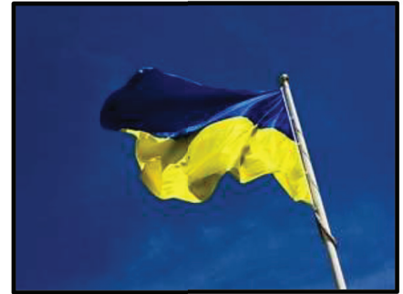
The Ukrainian flag continues to fly high after enduring months of war with Russia.

Financial assistance may be given through our denomination's relief organization – UMCOR.