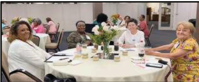
CRD UWF District officers recognized their unit presidents for their hard work during the past few years. The lunch was held at Scarritt Bennett, and an enjoyable time was had by all who attended.

We also shared with the presidents several important aspects of the recent Assembly of United Women in Faith in Orlando, Fla.