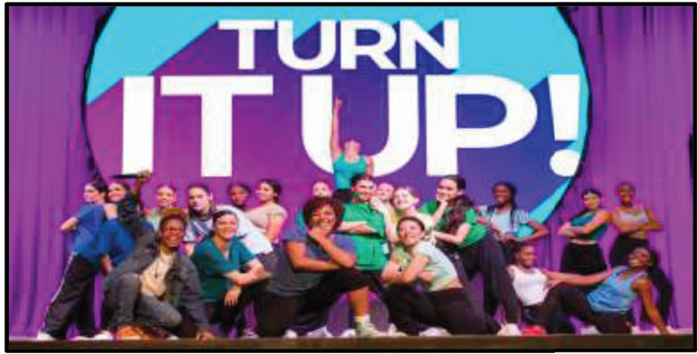
More than 3,000 gathered in Orlando, Florida, and online for United Women in Faith's Assembly 2022, held May 20-22 at the Orange County Convention Center. Twenty-four countries and all 50 states were represented at the event with the theme "Turn It Up." Read more at Women Turn It Up at Assembly 2022 | United Women in Faith (uwfaith.org) and check out the photos of this inspiring event on our Flickr page!