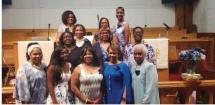
The John Wesley Women's Choir provided inspirational music at the Women's Day celebration.